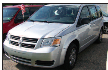
2010 DODGE GRAND CARAVAN 2 to choose from. Seats 7, Stow-N-Go, air, cruise AS LOW AS $229/MO*