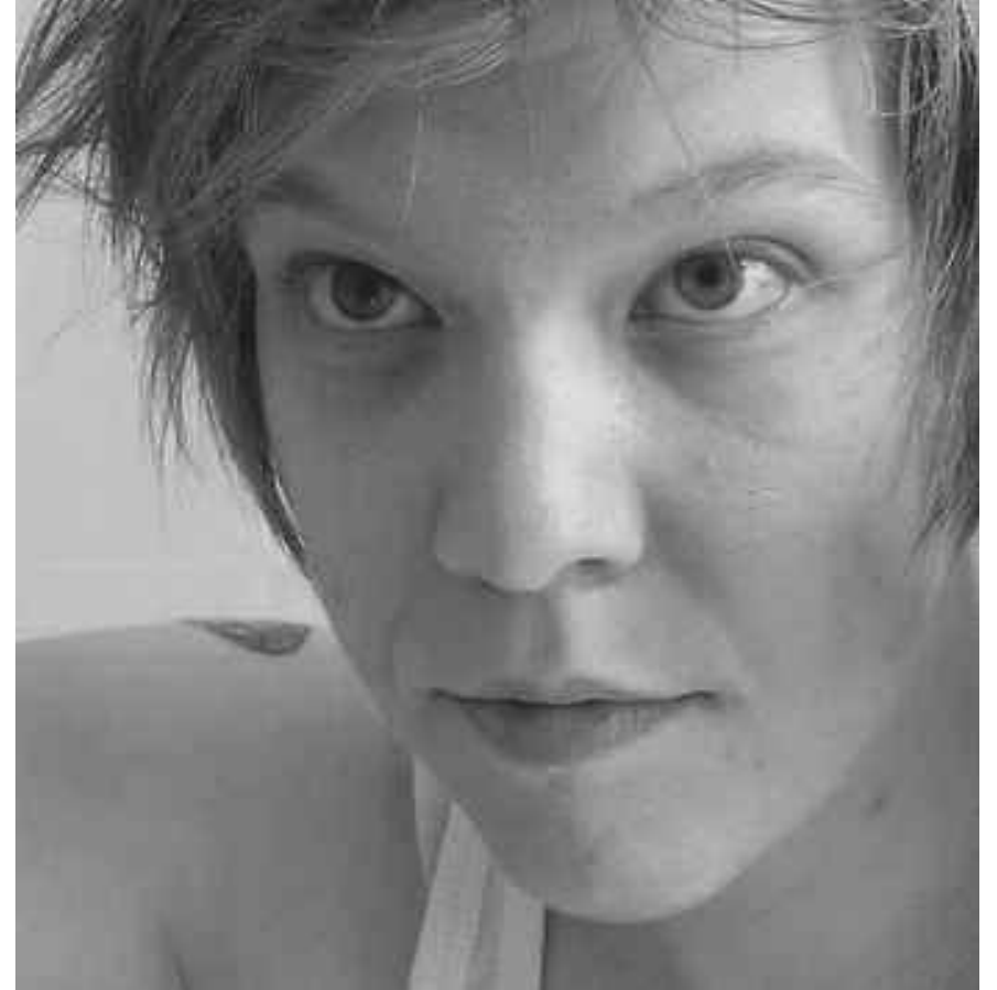
Dark circles and bags under the eyes can be signs of sleep deprivation.

Have a pre-sleep ritual. Having a ritual to prepare you for bedtime helps the brain to gradually adopt a sleeping mode. If you have trouble falling asleep, review your current habits for how you may be sending signals to your brain to stay awake. Engage in relaxing, not stimulating activities. For example, a warm bath or warm beverage (non-caffeinated, of course), reading a book (nothing too exciting) rather than watching television or working on the computer. Shut down the electronics (computer and television screens) about 90 minutes before you plan on going to sleep. Spending 30 minutes preparing for sleep rather than using that time for working will lead to better nighttime sleep and more productive work the next