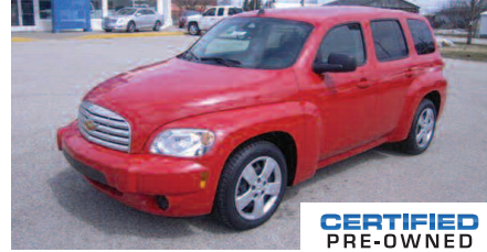
2011 CHEVY HHR LS #H1551 $12,995 OR $205/MO 72 MOS.**