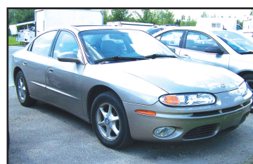
2002 OLDS AURORA 3.5 Sunroof, leather, loaded. $5,995