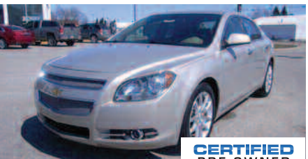
2009 CHEVY MALIBU LTZ #H1517 $13,995 OR $219/MO 72 MOS.**