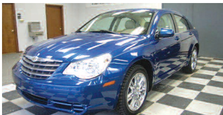
2009 CHRYSLER SEBRING LTD #G3957 $12,995 OR $204/MO 72 MOS.**