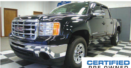
2011 GMC SIERRA SL CREW CAB #H1387 $26,995 OR $423/MO 72 MOS.**