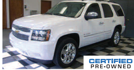
2009 CHEVY TAHOE LT SUNROOF, #G4184 $33,995 OR $532/MO 72 MOS.**