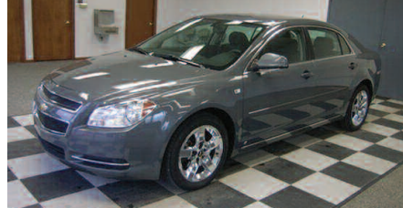
2008 CHEVY MALIBU LT #G4104 $10,995 OR $173/MO 72 MOS.**