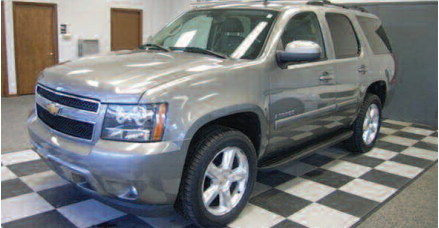
2007 CHEVY TAHOE LT LEATHER, DVD, SUNROOF #G4069 $15,995 OR $361/MO 48 MOS.**