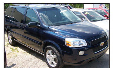
2006 CHEVY UPLANDER Seats 7, 4 captain chairs, air, cruise, 94 K. $7,495