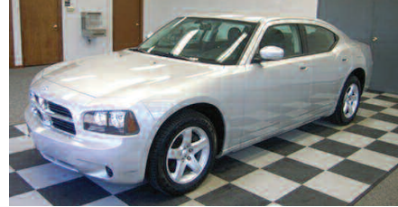
2010 DODGE CHARGER SE V6 #G4175 $15,495 OR $243/MO 72 MOS.**