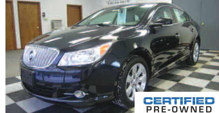
2012 BUICK LACROSSE CXL #G3867 $24,995 OR $392/MO 72 MOS.**