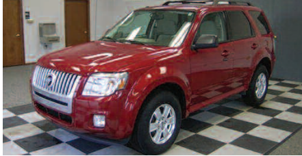
2010 MERCURY MARINER 4WD 4 CYL. #G4193 $15,495 OR $243/MO 72 MOS.**