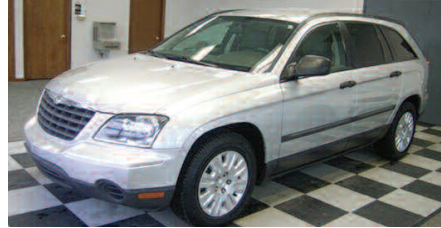
2006 CHRYSLER PACIFICA FWD #G4077 $8,495 OR $133/MO 72 MOS.**