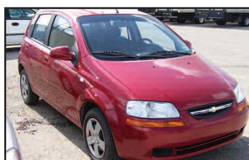
2008 CHEVY AVEO 5 5 speed, JVC sound, 34 MPG AS LOW AS $149/MO*