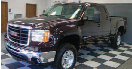
2008 GMC SIERRA 2500HD EXT CAB SLE #4196 $20,995 OR $329/MO 72 MOS.**