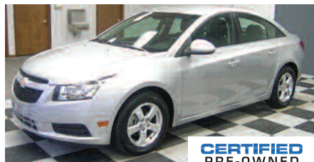
2012 CHEVY CRUZE LT #G3760 $14,995 OR $235/MO 72 MOS.**