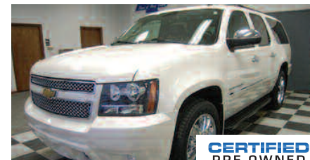
2010 CHEVY SUBURBAN LTZ #G4080 $36,995 OR $579/MO 72 MOS.**