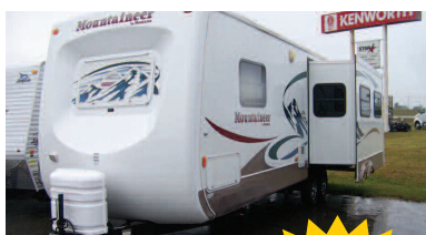
2005 MONTANA MOUNTAINEER 315RLS

31ft travel trailer with a full size slide out and a very spacious living room. Priced to move this week