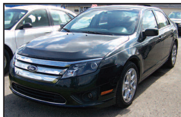
2010 FORD FUSION Air, cruise, good MPG, nice, clean AS LOW AS $199/MO*