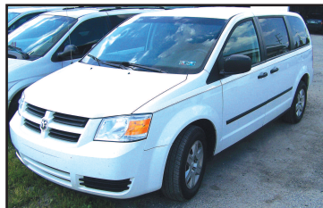
2009 DODGE CARAVAN C/V Cargo Van, 81K, air, cruise, new tires. AS LOW AS $249 /MO*