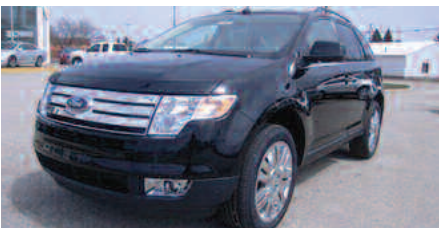
2008 FORD EDGE LIMITED AWD #H1526 $16,995 OR $266/MO 72 MOS.**