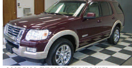
2007 FORD EXPLORER EDDIE BAUER #G4094 $13,495 OR $212/MO 72 MOS.**