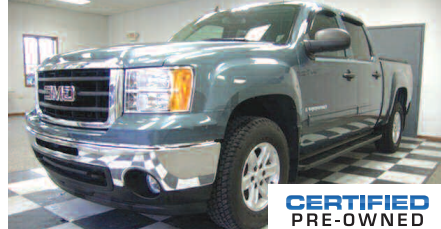
2009 GMC SIERRA SLE CREW CAB #H1386 $23,995 OR $376/MO 72 MOS.**