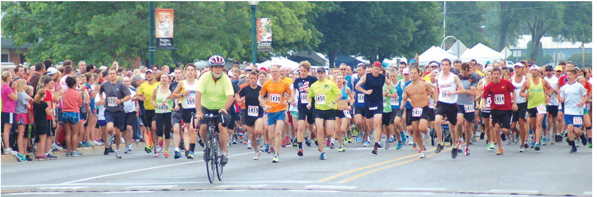
And they're off! The annual Boyne City Independence Day 10K run.