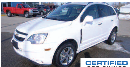
2012 CHEVY CAPTIVA FWD LEATHER #H1513 $20,995 OR $329/MO 72 MOS.**