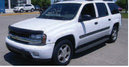
2004 CHEVY TRAILBLAZER EXT LS #H1550 $5,995 OR $180/MO 36 MOS.**