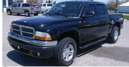
2002 DODGE DAKOTA QUAD CAB SLT #H1507 $5,495 OR $127/MO 48 MOS.**