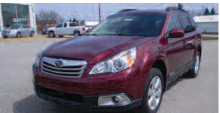
2012 SUBARU OUTBACK PREMIUM #H1544 $23,995 OR $376/MO 72 MOS.**