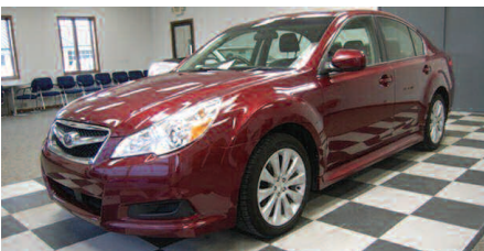
2011 SUBARU LEGACY LIMITED #H1543 $17,995 OR $282/MO 72 MOS.**