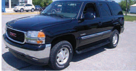
2005 GMC YUKON SLE #H1569 $7,495 OR $173/MO 48 MOS.**