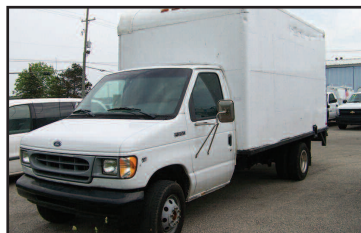
1998 FORD E-350 CUBE VAN Lift gate, 169K. ONLY $3,995