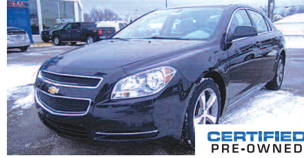
2011 CHEVY MALIBU LT #H1421 $14,995 OR $235/MO 72 MOS.**