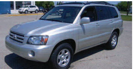
2004 TOYOTA HIGHLANDER #H1581 $8,995 OR $170/MO 60 MOS.**