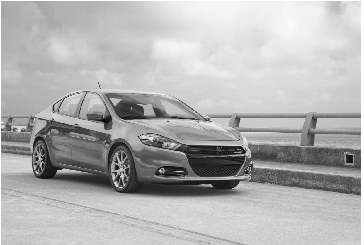
Dodge recently announced that two new 2013 Dodge Dart "Special Edition" packages and a new Rallye Appearance Group are available in Dodge dealerships across the United States.