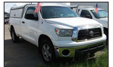
2008 TOYOTA TUNDRA SR5 Air, cruise, locking work box cover AS LOW AS $199/MO*