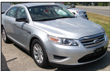
2010 FORD TAURUS Sirius radio, air, cruise. AS LOW AS $239/MO*