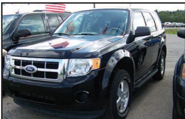
2012 FORD ESCAPE 4 new tires, air, cruise $15,900

Financing Made Easy! Highest Quality Cars & Trucks