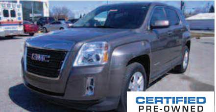
2011 GMC TERRAIN SLE AWD #H1503 $20,995 OR $329/MO 72 MOS.**