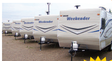
2014 WEEKENDER TRAVEL TRAILER

Very light weight trailer that most Van and SUVs can pull weights 2,500lbs. It also has AC, furnace and more.