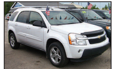
2006 CHEVY EQUINOX LT AWD, leather, sunroof. AS LOW AS $199/MO*