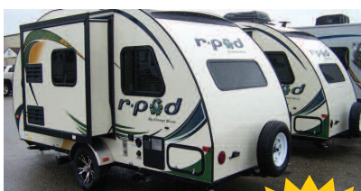
2014 R-POD TRAVEL TRAILER

SUMMER HOURS: MON-FRI 9AM - 6PM, SAT 9AM - 5PM, SUN NOON - 4PM. CLOSED JULY 4TH.