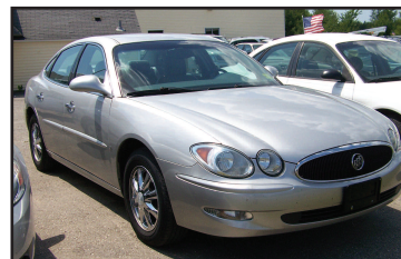
2006 BUICK LACROSSE Leather, loaded. AS LOW AS $219/MO*