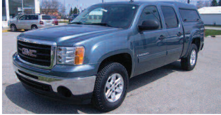
2009 GMC SIERRA CREW CAB SLE #H1547 $22,495 OR $352/MO 72 MOS.**