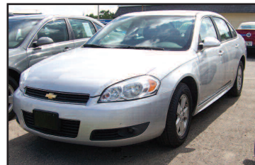
2010 CHEVY IMPALA Air, cruise, 29 MPG, nice AS LOW AS $199/MO*