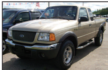
2001 FORD RANGER XLT 4x4 Off Road, bedliner, bedcover, air, cruise AS LOW AS $199/MO*