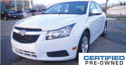
2012 CHEVY CRUZE LT #H1375 $15,495 OR $243/MO 72 MOS.**