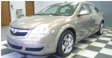
2007 SATURN AURA XE, 6 CYL. #G3927 $10,995 OR $173/MO 72 MOS.**