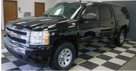
2007 CHEVY SILVERADO 1500 CREW LT #G4079 $15,495 OR $357/MO 48 MOS.**