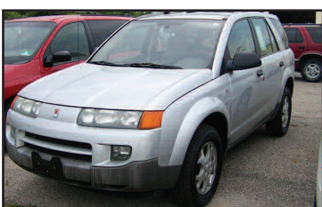
2003 SATURN VUE AWD, air, cruise. AS LOW AS $199/MO*