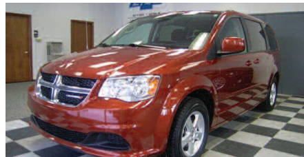
2012 DODGE GRAND CARAVAN SXT #G3921 $17,995 OR $282/MO 72 MOS.**