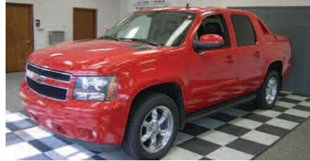
2007 CHEVY AVALANCHE 3LT LEATHER, SUNROOF #3774A $16,495 OR $380/MO 48 MOS.**